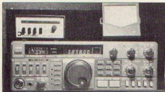
Photo B. Notice the 10 segment LED bar graph at the top of the ANF for displaying search and lock action.